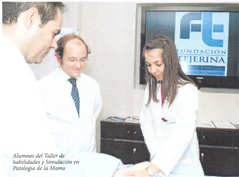
Alumnos del Taller de habilidades y Simulación en Patología de la Mama