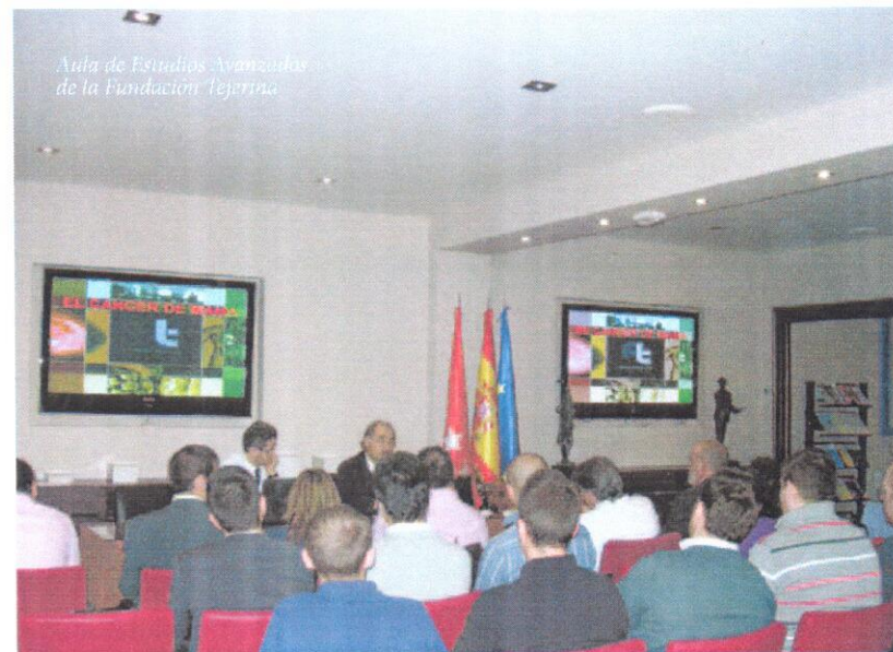
Aula de Estudios Avanzados de la Fundación Tejerina